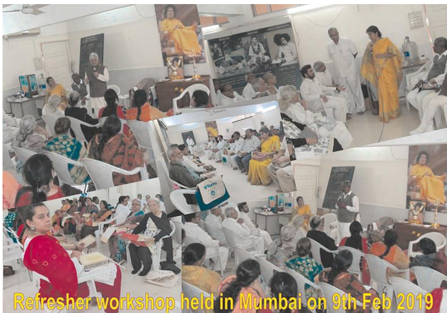
Refresher workshop held in Mumbai on 9th Feb 2019

A highly informative and interactive refresher course, attended by 36 practitioners, was conducted by a Senior Vibrionics teacher 10375 . She