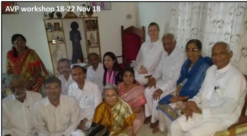
AVP workshop 18-22 Nov 18