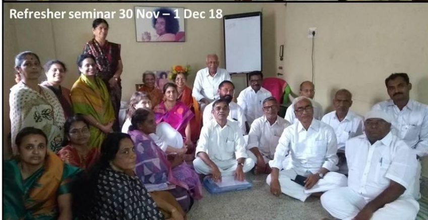
Refresher seminar 30 Nov – 1 Dec 18