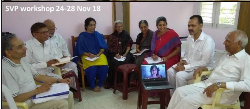
SVP workshop 24-28 Nov 18