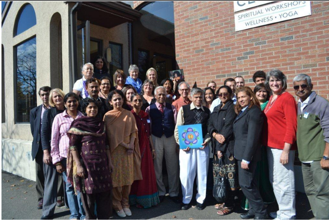
JVP Training Class 20-21 October 2012 in Hartford CT USA