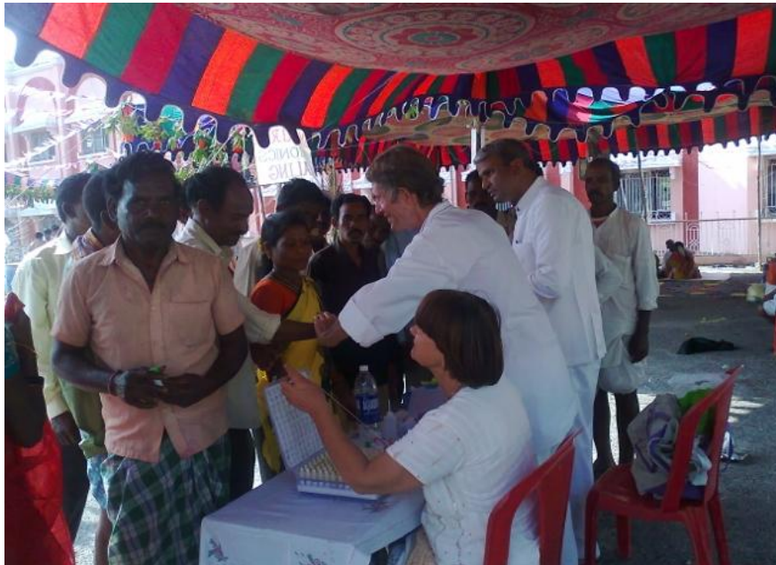
Medical Camp 21-23 November 2012 at PN Railway Station, Puttparthi