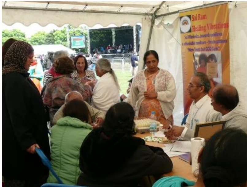
Vibrionics stall at the Unity of Faiths festival in Southall Park, London