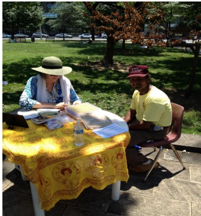
Vibro in Park - Serving the Homeless Washington DC USA