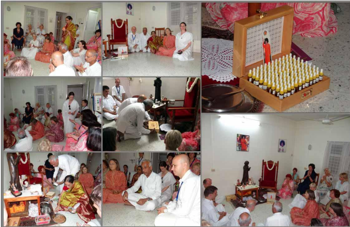
16 August 2011: Practitioners prayerfully offering the 108CC Master box at Swami's Lotus feet