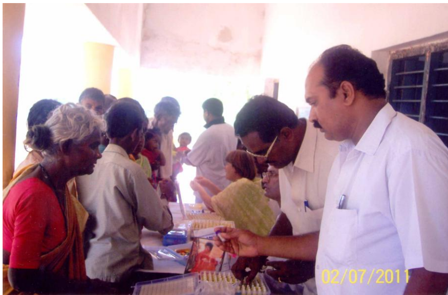
2 September 2011: Vibrionics Health Camp held near Puttaparthi...300 patients treated

ATTENTION: If your email address changes in the future, please inform us at news@vibrionics.org as soon as possible. Please share this information with other vibro practitioners who are not aware of this new email service.