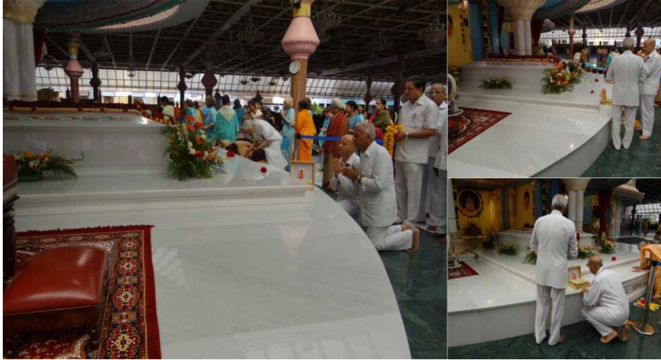
17 August 2011: Vibrionics 108CC Master box offered at Bhagawan Baba's Mahasamadhi